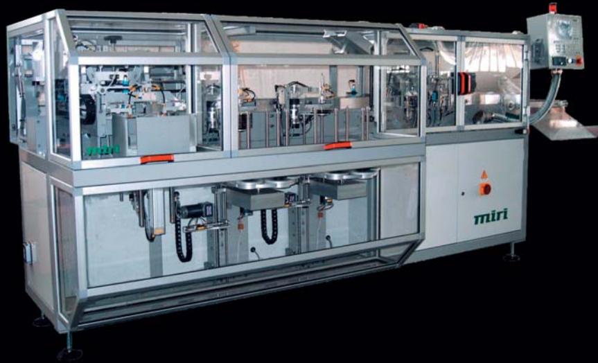
DPM DOUBLE MACHINE